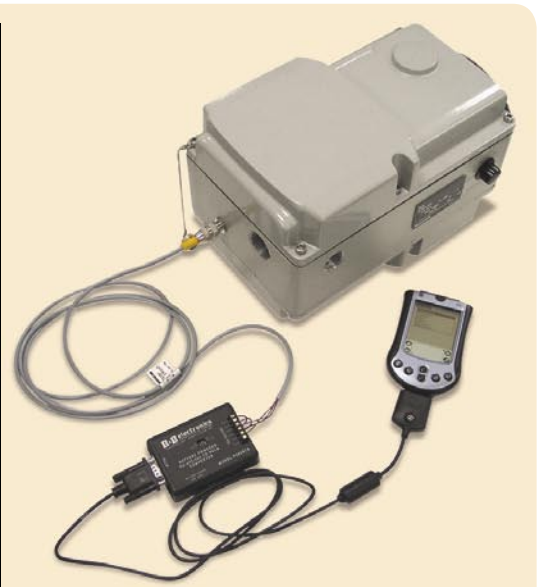
HercuLink Palm Software